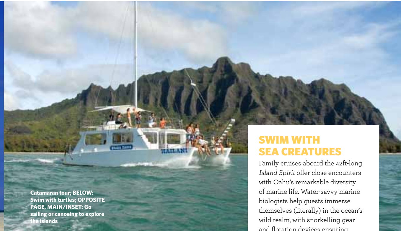
Catamaran tour; BELOW: Swim with turtles; OPPOSITE PAGE, MAIN/INSET: Go sailing or canoeing to explore the islands

Polynesian voyaging canoes, and how traditional sailing canoes are built with native plants, as well as explaining the historical significance of the Hakipuu and Kualoa area. He sails around the island of Mokoli'i (also known as "Chinaman's Hat" for its resemblance to the straw headgear), offshore from Kualoa. Often you will encounter spinner dolphins riding the waves just in front of the canoes, while at the island there is time for snorkelling with green turtles (known locally as honu ).